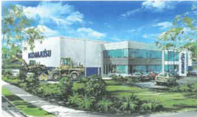
Architect drawing of Komatsu NZ's new Auckland office.

Komatsu Australia's New Zealand operation has recently opened new premises at opposite ends of the country: a new head office in Auckland,