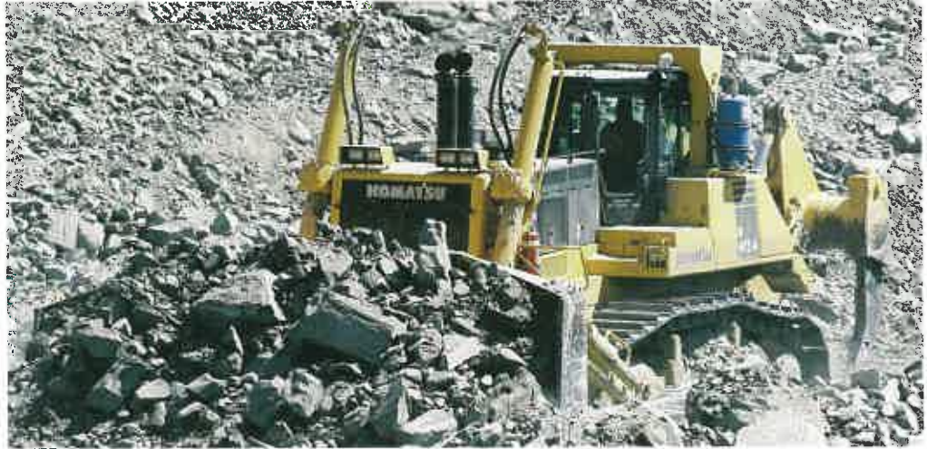
The new D475A-5 has a low 70 dBA in-cab noise level.

At the same time, external noise levels have been reduced to 110 dBA dynamic (ISO 6395), well below the present strict