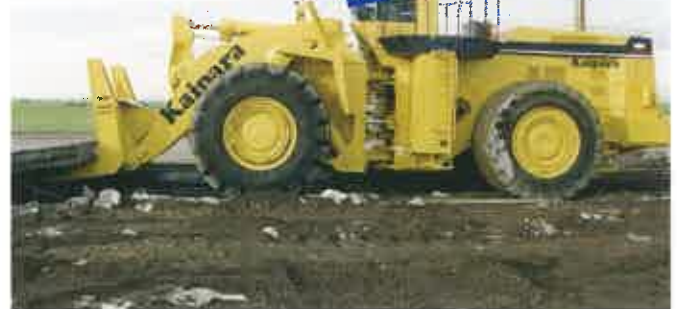
"The WA800-1 still performing as well as the day it was built...."

In total, it has three WA800s, known as Godzilla #1, Godzilla #2 and Godzilla #3.