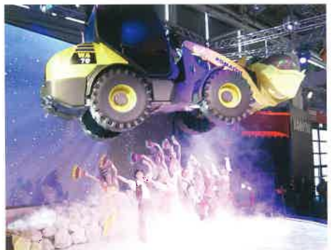
A key feature was the "flying" WA70 wheel loader.