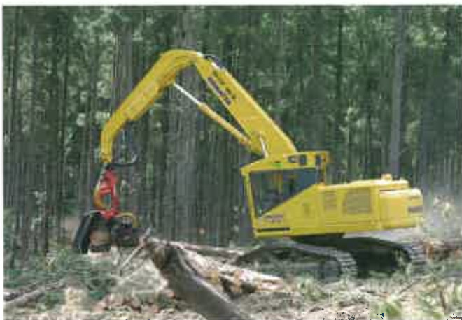
The PC270-7 during a demonstration on the Komatsu stand.

These included the Valmet 445EX with Valmet 390 head, the Valmet 445EXL with Valmet 385 head, the Valmet 890.2/8 forwarder and the Timbco TF820E forwarder.