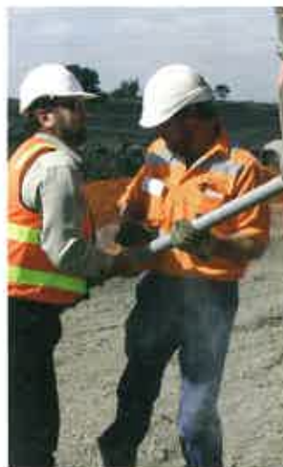
A demonstration of correct drill-steel handling

He said the concept of a workshop for the operator end of the industry to develop new safety procedures was a first for the quarry sector.