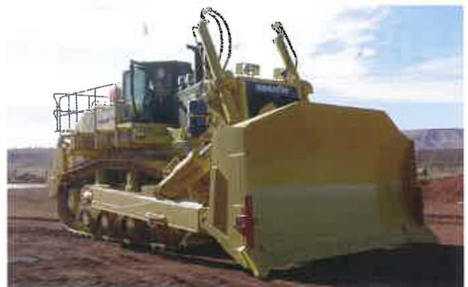
D475A-5 in West Angelas operation

"The layout of the cab is well designed and operators have indicated that it is particularly comfortable and quiet during operation. These features are attractive from a safety perspective as they will contribute to reduced operator fatigue."