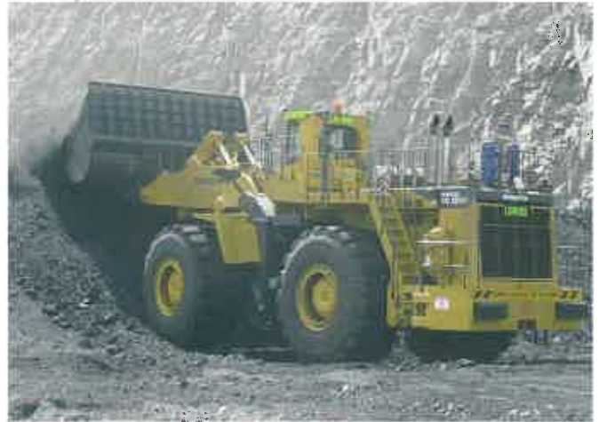
These two photos show Peak Downs new WA1200-3 wheel loaders, fitted with high-lift arms and 30 cu m buckets.

"The alternatives didn't have the reach to load our new haulage systems easily and efficiently," he said. "We've opted to fit these new loaders