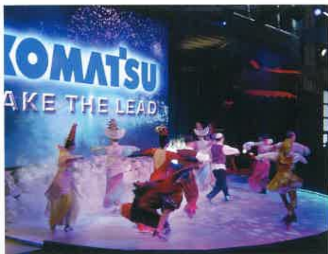
Komatsu's "Take the Lead" show.

Other highlights of Bauma week included a joint dinner and show with the Civil Contractors Federation, and a farewell dinner at the Austinkellar, the oldest beer garden in Munich.