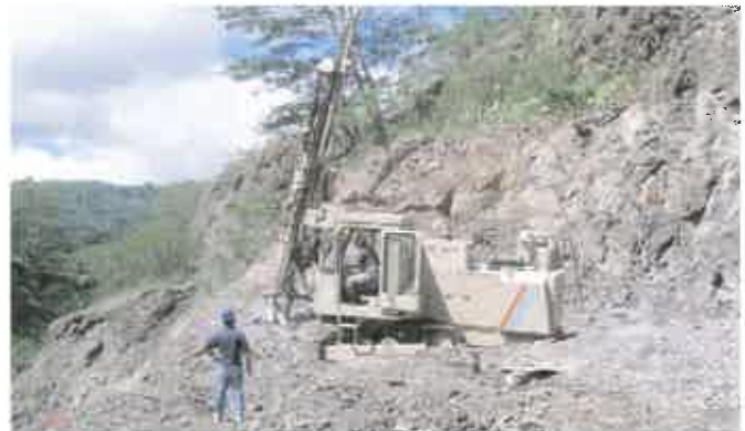
The Ingersoll-Rand LM401 crawler drill in operation at the Alafua Quarry in Western Samoa.

The Alafua Quarry has been in operation for around 30 years, supplying basalt material for all roadworks, building developments, airports and general infrastructure in Western Samoa.