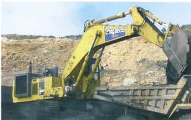
PC1250-7 loading coal at Stockton mine operation.

"The other important factor was the speed of delivery Komatsu could offer; we were under tremendous pressure to start on this project, with very limited lead in time."