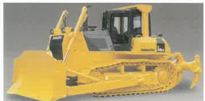
The D85EX-15 dozer sets new standards in comfort and controllability.

on the company's successful new Dash 5 series large mining dozers. This ERG Class D06 dozer has an operating weight of 28,000 kg (without attachment) and is powered by a 179 kW turbocharged and aftercooled Komatsu SA6D125E-3 diesel engine meeting Tier II emission requirements.