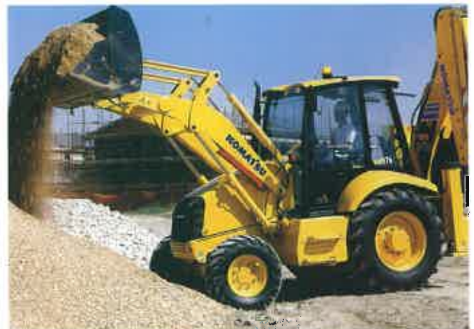
Komatsu's new WB97R-2 Tier II backhoe/loader.