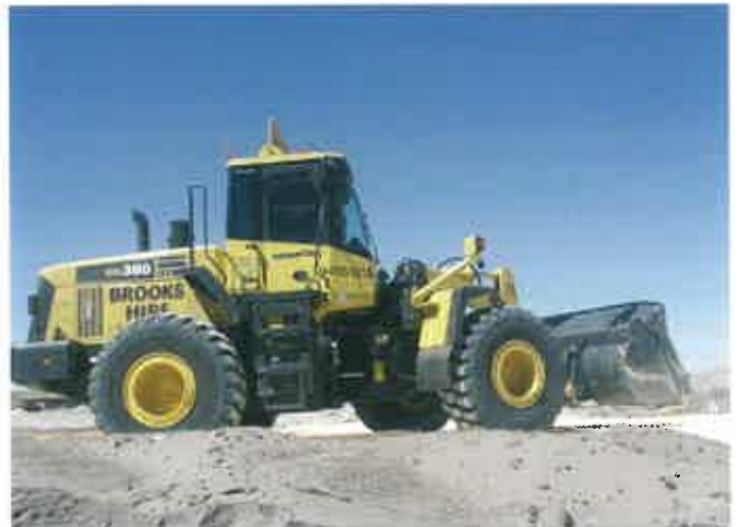
This Komatsu WA380-5 is one of 30 loaders owned by Brooks Hire.

"Well, they are not a competitor for starters!" he says.