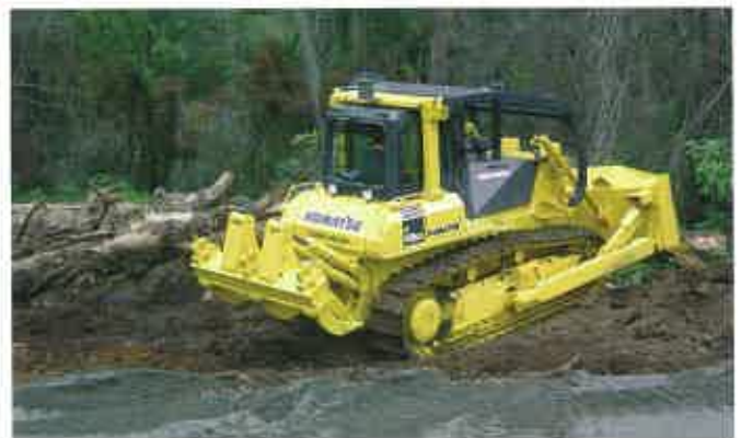
Mountain Industries' D65EX-15 dozer in subdivision work.

buyer of Komatsu equipment for about the past 13 years, with a fleet that includes six excavators, six wheel loaders, a GD530A-2 grader and a WB97R-2 backhoe.