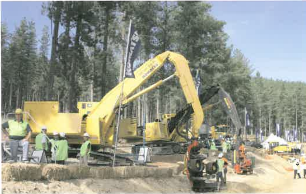
Komatsu Australia displayed an array of forestry machinery at AusTimber 2004.

Komatsu Australia had a highly successful AusTimber show in early April, with over 1000 timber industry contractors, operators, owners and managers visiting our stand – and that of our new “sister” company Komatsu Forest.