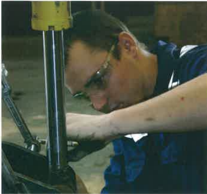
Komatsu field service personnel can advise on machinery attachments.

Attachments give a lot more versatility to your equipment, whether for an excavator, skidsteer or backhoe.