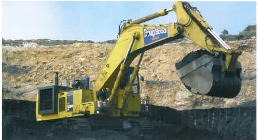
Doug Hood Mining's new PC1250-7 excavator has exceeded expectations since starting at the Stockton Mine in Westport, NZ.

The mine is on a plateau about 1200 m above sea level, so in addition to the West Coast's high rainfall levels, it has to contend with regular snowfalls