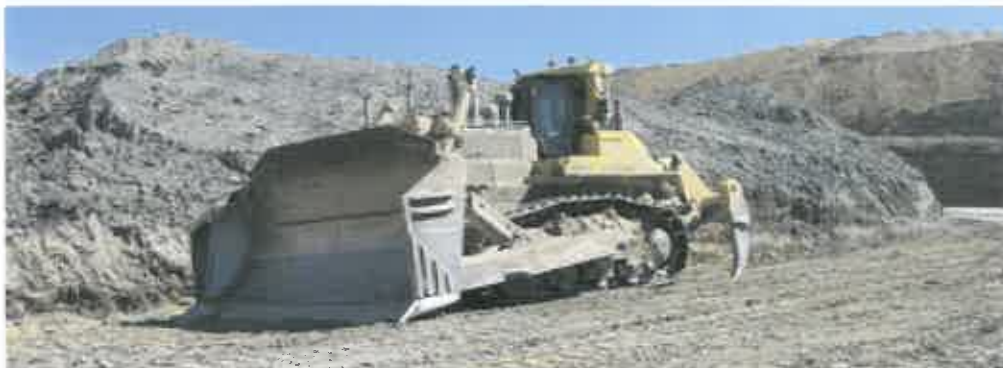
Comiskey's D475A-3 Super Dozer

"Overall, I've been really pleased with the machine. I don't know why more of these haven't been sold in Australia; they are very well suited to this application."