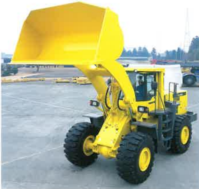
Komatsu's new Tier II WA500-3 loader features a low-emission engine.

Komatsu has released a new Tier II version of its successful WA500-3 wheel loader, a machine which has proved highly popular in the Australian market.