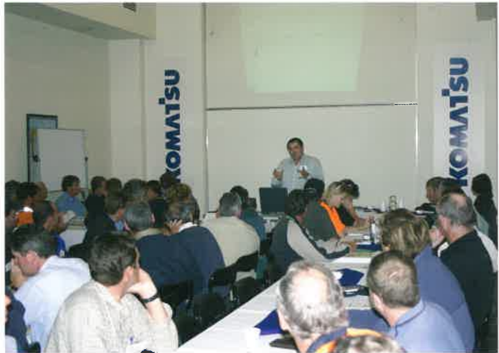
CMPA drill conference held at Komatsu Campbellfield office.

Every effort was made to ensure that operators, owners and regulators were well represented at the workshop.