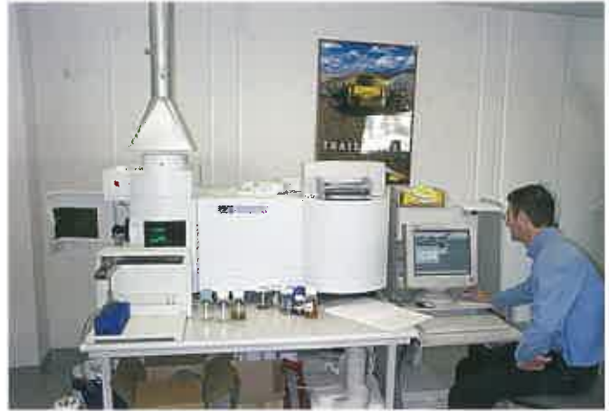
Komatsu Australia has sophisticated condition monitoring labs in both Perth and Brisbane, able to offer a wide range of component analysis services.

"Many mines and quarries have as much fixed plant requiring condition monitoring as they do mobile plant," he said. "We are now able to go to these companies and provide monitoring services for all aspects of machinery on a single invoice.