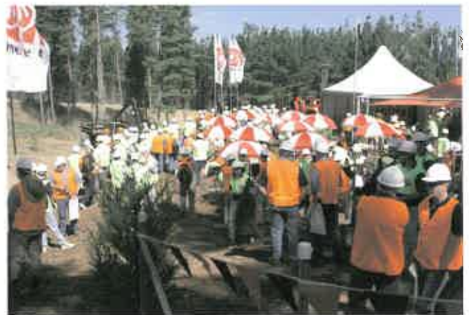
Komatsu Forest stand.