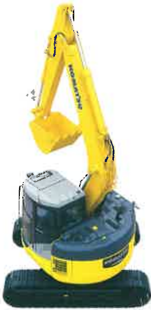
Introducing Komatsu's PC138US-2 excavator.

Komatsu Australia has released a new short-tail excavator in the 13 tonne class, the PC138US-2. It replaces the PC128US-2.