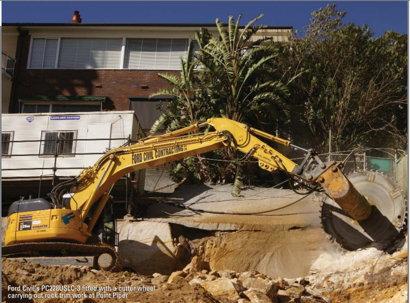
Ford Civil's PC228USLC-3 fitted with a cutter wheel carrying out rock trim work at Point Piper