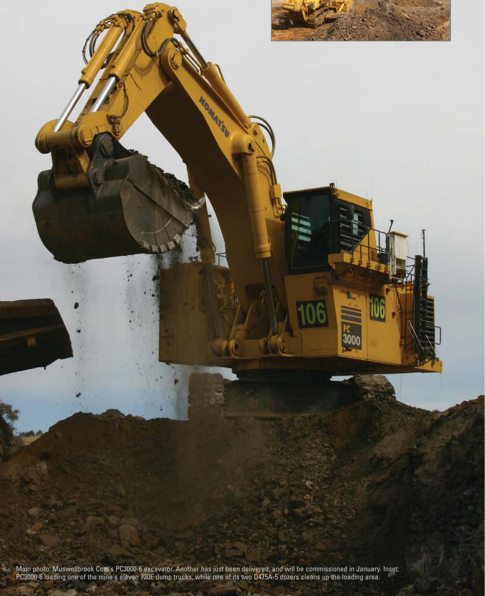
Main photo: Muswellbrook Coal's PC3000-6 excavator. Another has just been delivered, and will be commissioned in January. Inset: PC3000-6 loading one of the mine's eleven 730E dump trucks, while one of its two D475A-5 dozers cleans up the loading area.