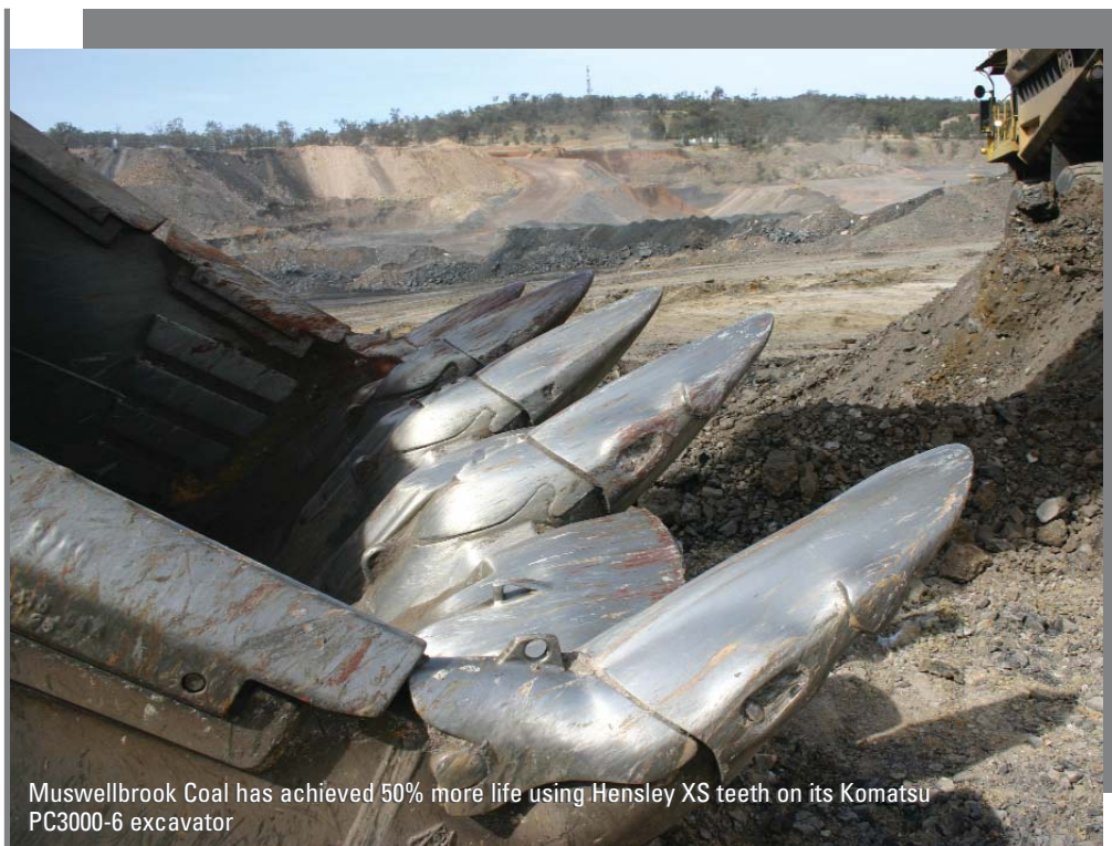
Muswellbrook Coal has achieved 50% more life using Hensley XS teeth on its Komatsu PC3000-6 excavator