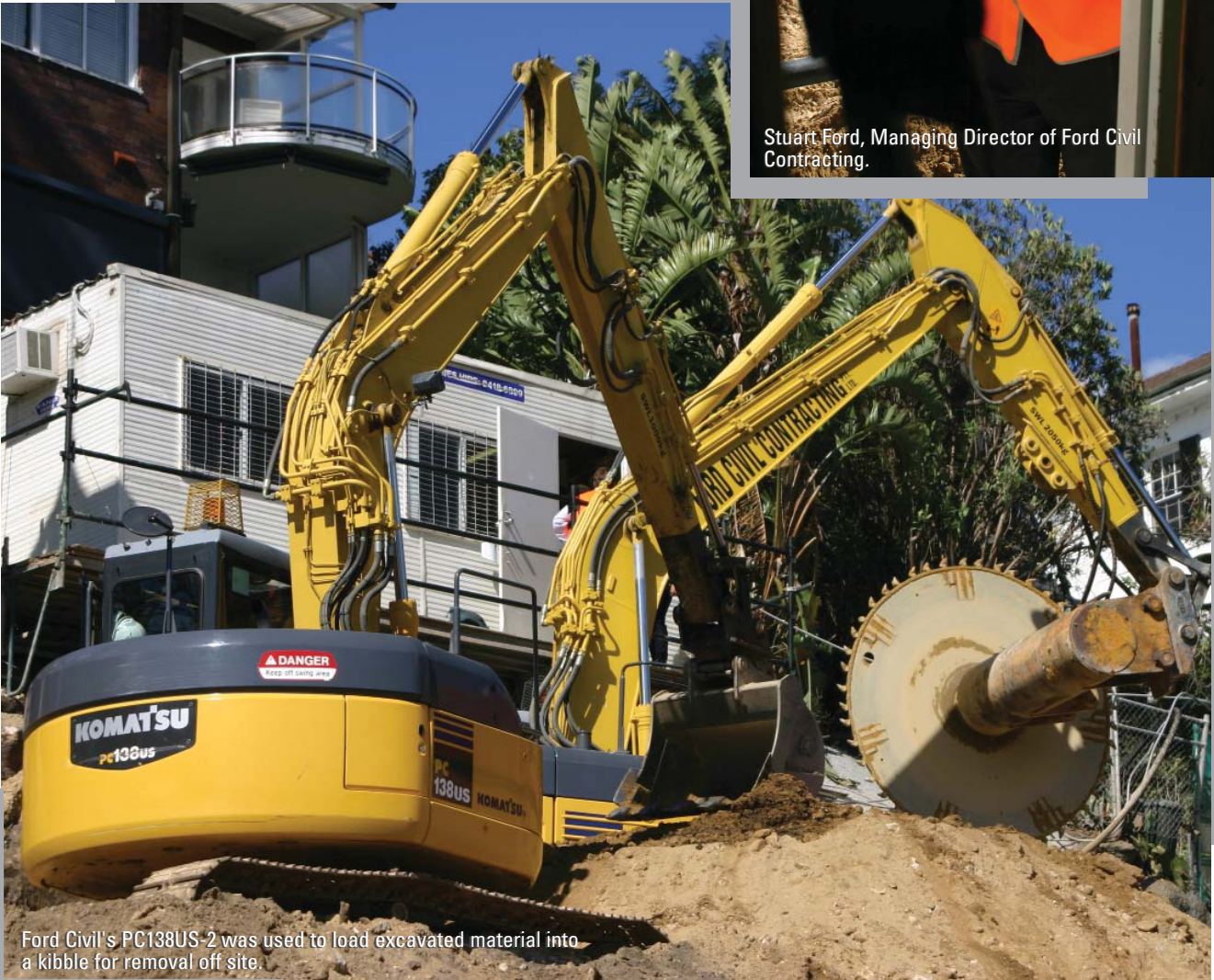
Ford Civil's PC138US-2 was used to load excavated material into a kibble for removal off site.